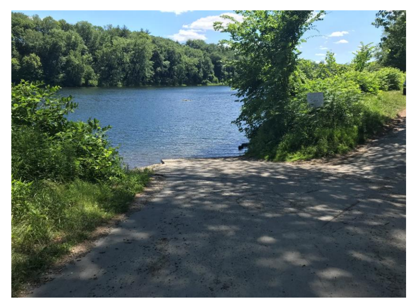
Approach to Putney Landing boat ramp looking downriver/south (June 2021)